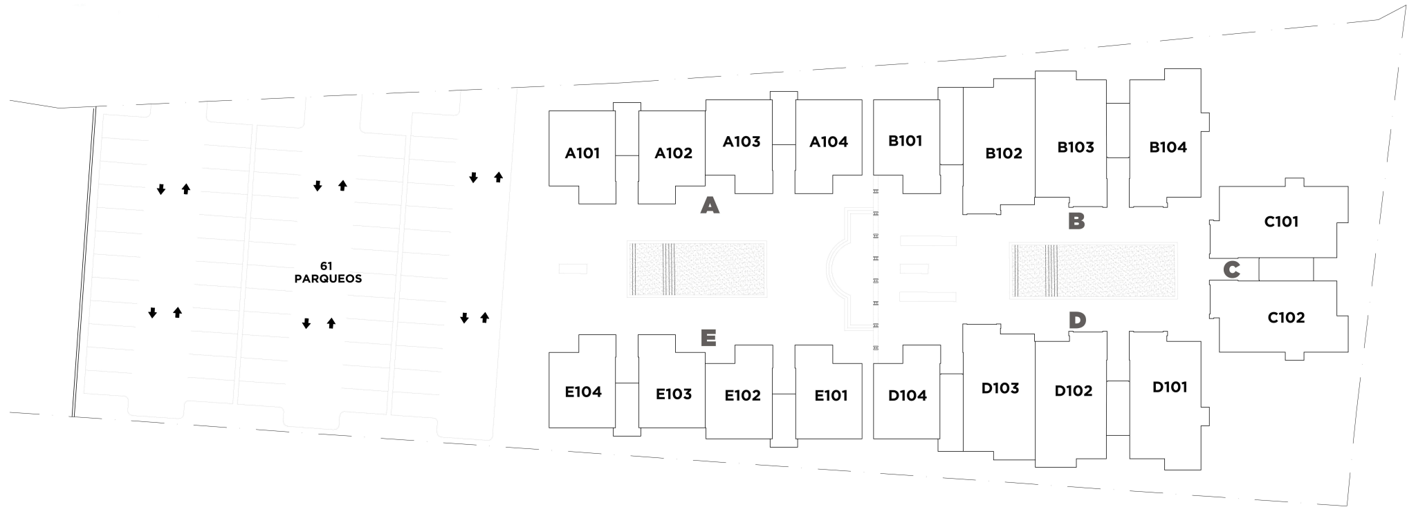
PRIMER NIVEL / FIRST LEVEL