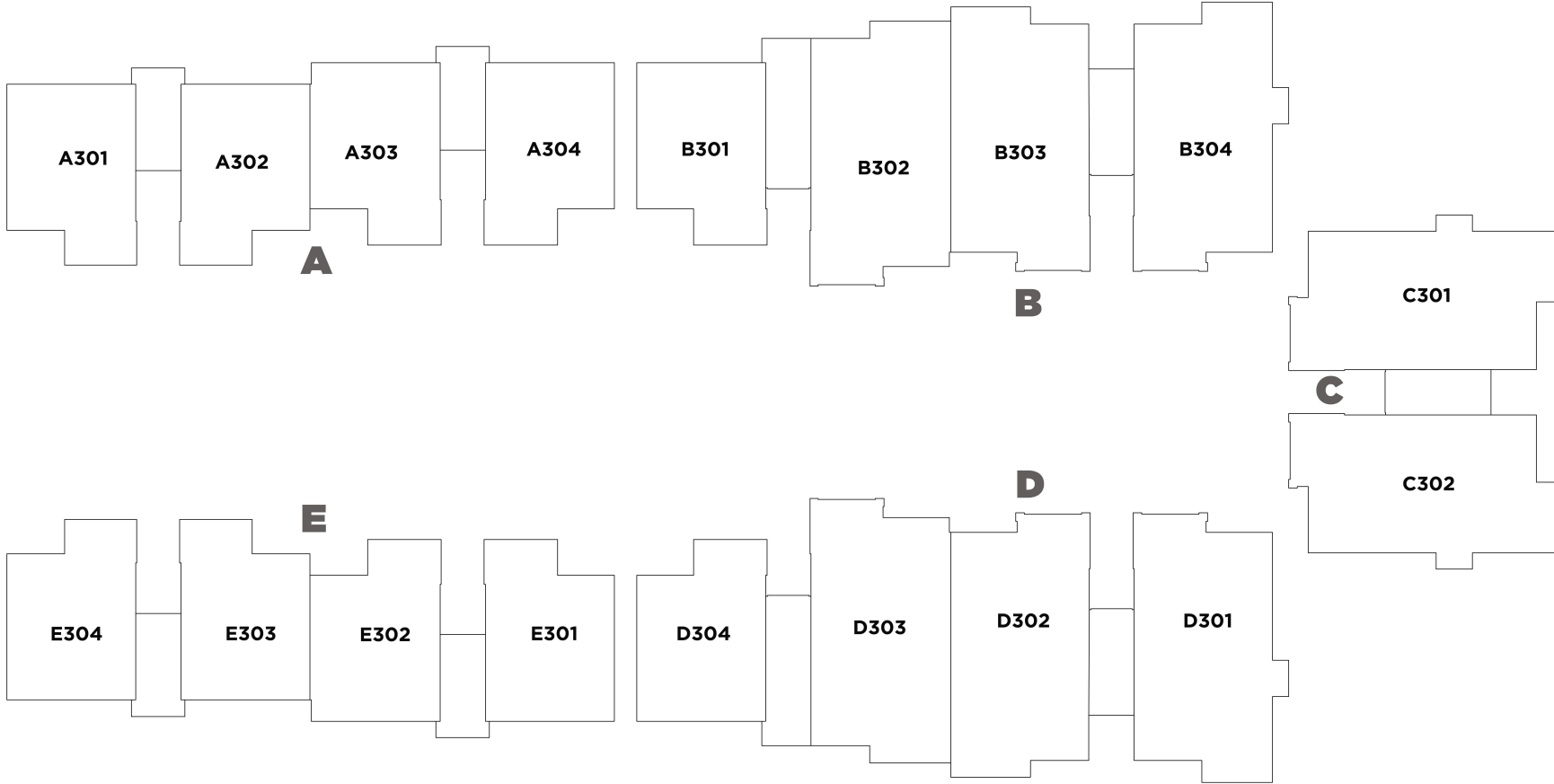
TERCER NIVEL / THIRD LEVEL