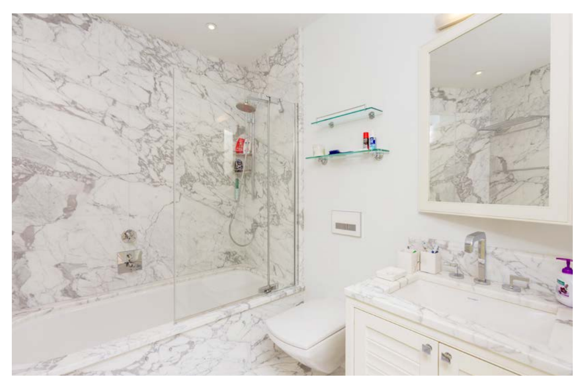
Large sunny bedroom and modern en-suite bathroom