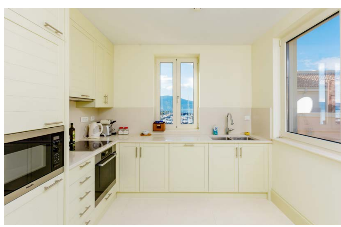
Sunny living area and kitchen with modern fittings