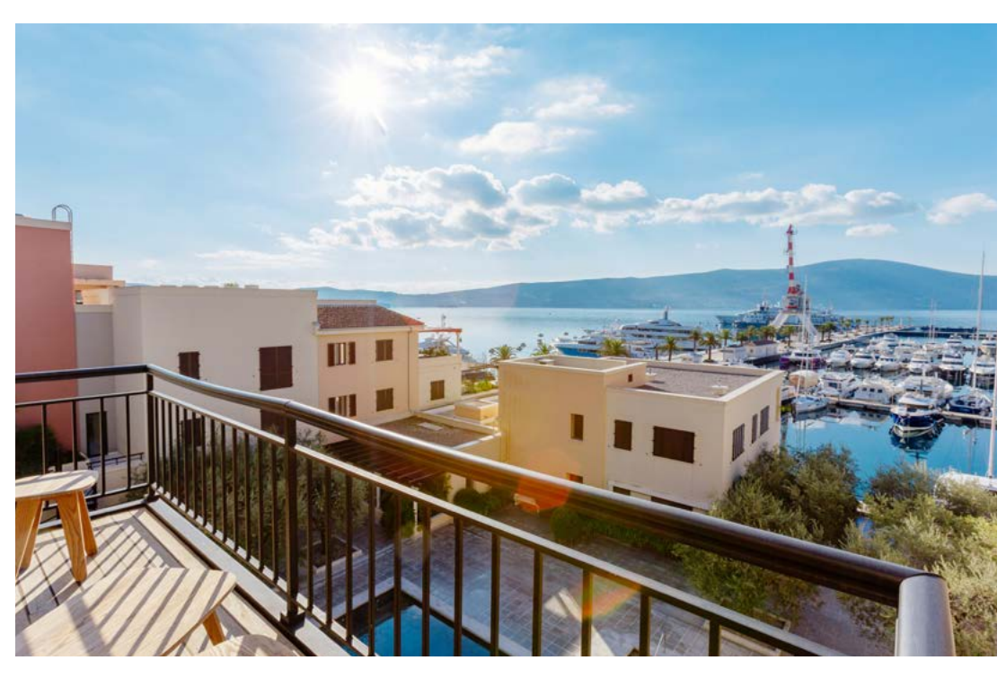
Large sunny bedroom and view from balcony