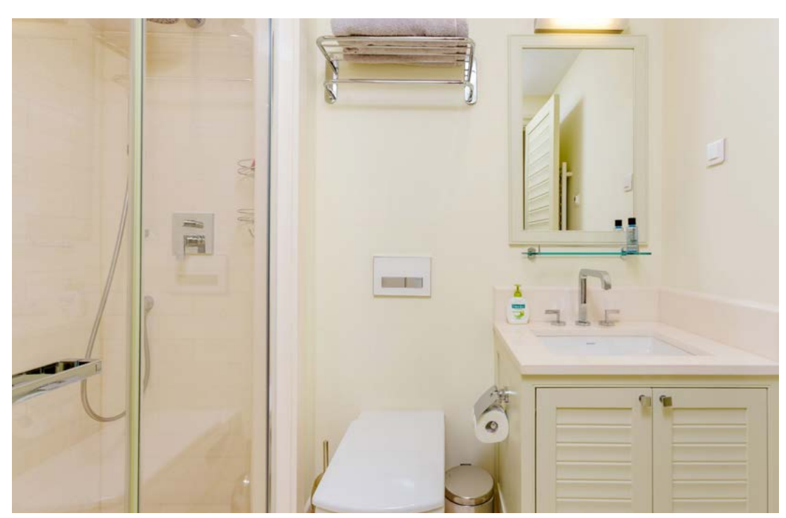
Large sunny bedroom and modern en-suite bathroom